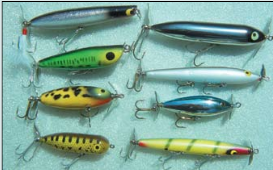
Propeller baits come in all sizes and color schemes. Shown are (left row, from top) Lubr Jensen's Jerk'n Sam, Dalton Special and Nip-I-Diddee; Heddon's Baby Torpedo; (right row, from top) Heddon's Wounded Spook; Cotton Cordell's Boy Howdy and Crazy Shad; and Smithwick's Devil's Horse.